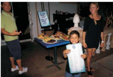
Photo on the right is a 20 sec time exposure.